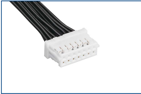
Shown with Contacts Inserted