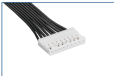
Shown with Contacts Inserted